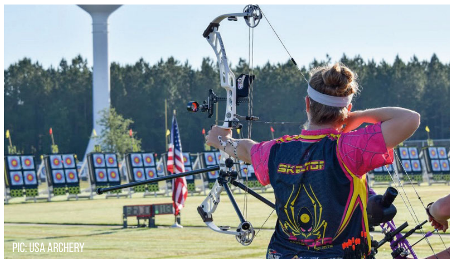
PIC: USA ARCHERY

The full tournament schedule will be available soon with details on registration. Go to www.eastonarcherycentercv.org/tournaments/socal for more information.