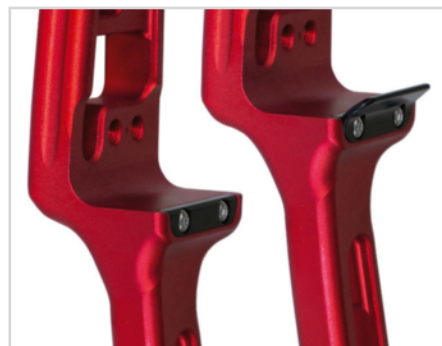
ABOVE: THE REVOLUTION'S INTERCHANGEABLE SHELF PLATE

Whether you are a Mybo convert or you have yet to experience a UK-made compound bow for yourself, the Revolution is leading the way in compound technology, pushing the limits of design. Perhaps you could choose to lead it with a Revolution of your own? 🎯