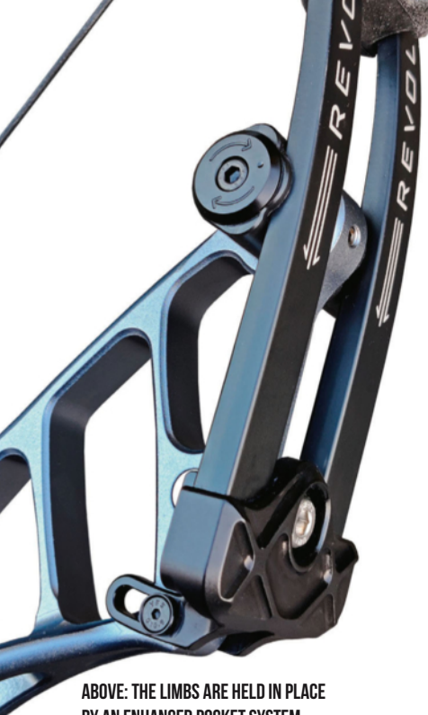
ABOVE: THE LIMBS ARE HELD IN PLACE BY AN ENHANCED POCKET SYSTEM

tune out this unwanted torque and achieve perfect arrow flight.