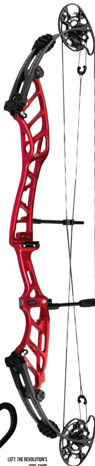
LEFT: THE REVOLUTION'S COOL CAMS